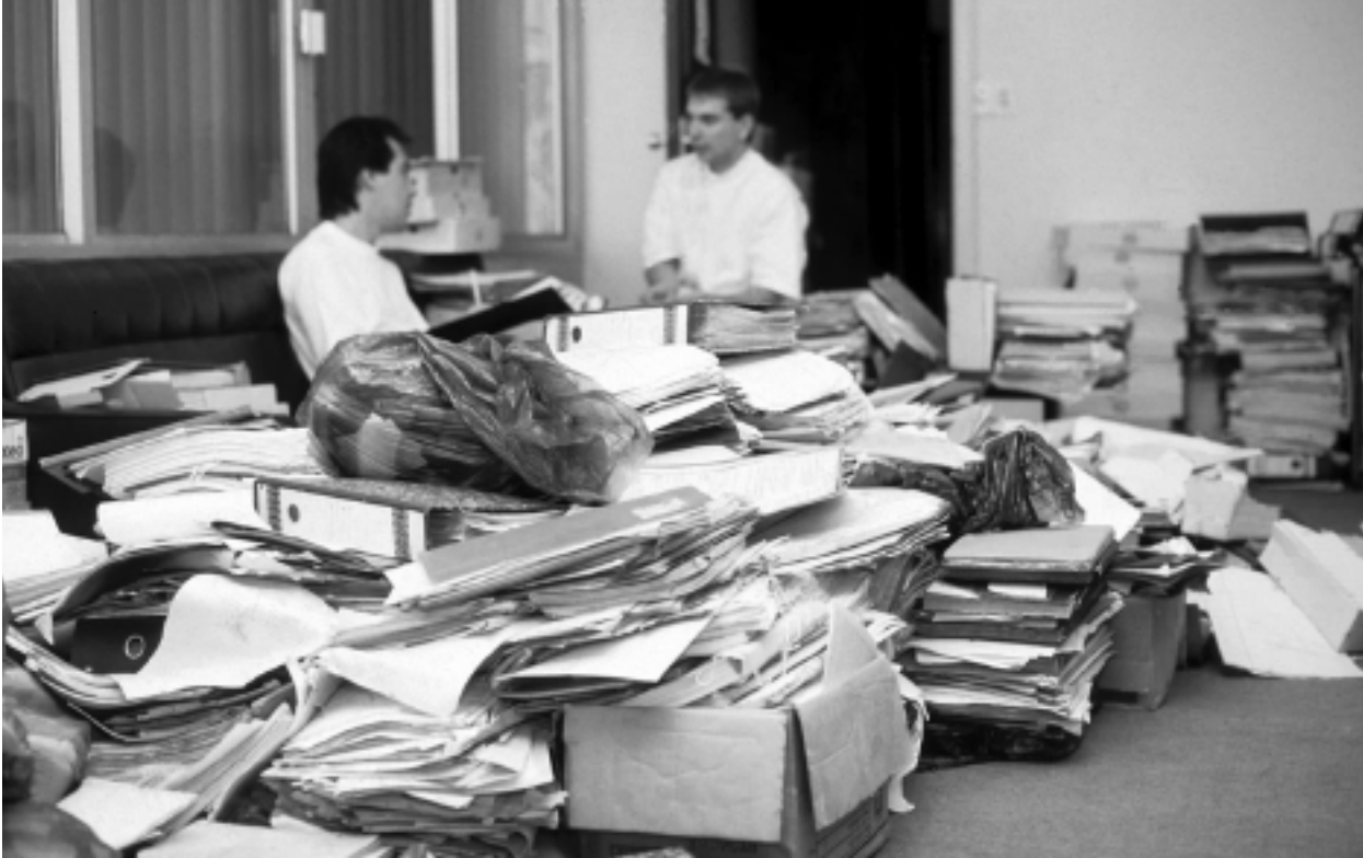
A small portion of the thousands of files found in December 1992, known as the Terror Archive , which documented the thousands of cases of people who had reportedly been arrested, killed, tortured and disappeared by State forces.

Nickson, an economist at the University of Birmingham, United Kingdom, includes: