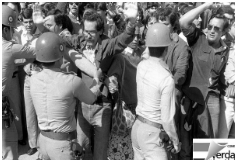
(Above left) Citizens in Asunción, capital of Paraguay, celebrate the return of democracy. (At right) The police suppress a public demonstration during Stroessner's regime.