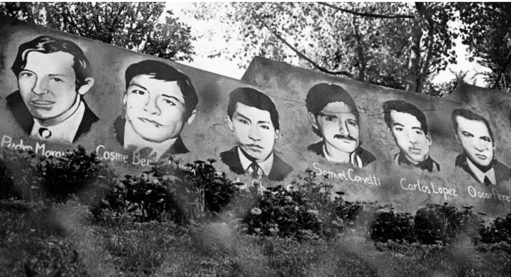
La Paz, Bolivia. Mural on the wall of a park in memorial of persons who disappeared during Banzer's regime.